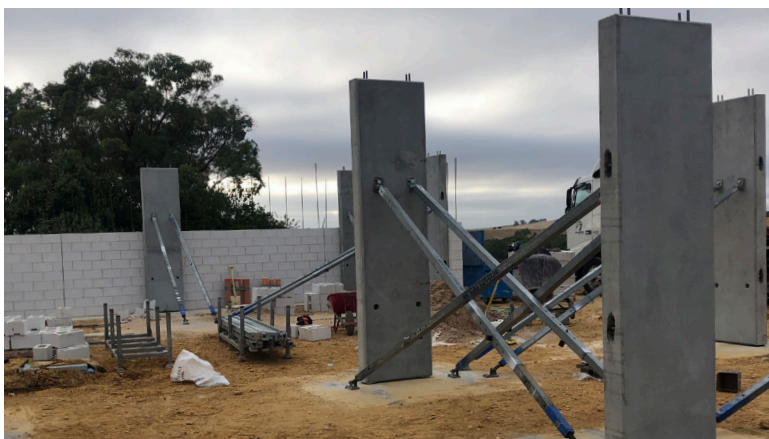
Used for fastening temporary props for concrete tilt panels

Used for connecting temporary props to pre-cast concrete panels. Bolts are screwed into ferrules cast-in to the concrete and remain in place until the panel is permanently secured. The Bolts are then removed and the holes are patched.